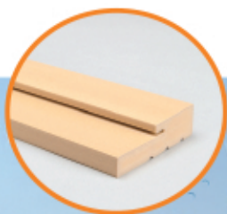
Composite Door Frames

MP Doors with Hydroshield Technology are engineered to provide protection from water infiltration, allowing you to enjoy the look of real wood without the worry about warping, rotting and delamination. The powerful combination of reinforced fiberglass door panels edged in waterproof composite material and full composite frames repel water and withstand use in the harshest conditions.