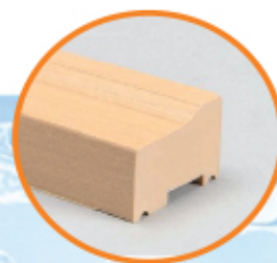
Composite Brick Mold